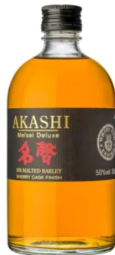
WHISKIES | BLEND AKASHI MEÏSEI DELUXE 50CL / 50°