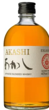
WHISKIES | BLEND AKASHI BLENDED 50CL / 40°