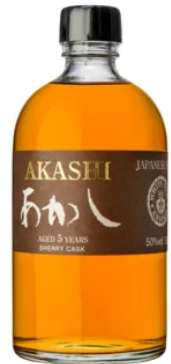
WHISKIES | SINGLE MALT AKASHI 5 YEAR OLD SHERRY CASK 50CL / 50°