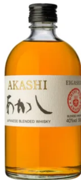
WHISKIES | BLEND AKASHI BLENDED 50CL / 40°