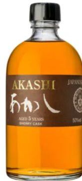
WHISKIES | SINGLE MALT AKASHI 5 YEAR OLD SHERRY CASK 50CL / 50°