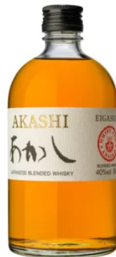
WHISKIES | BLEND AKASHI BLENDED 50CL / 40°