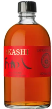
WHISKIES | SINGLE MALT AKASHI 5 YEAR OLD RED WINE CASK 50CL / 50°