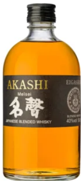
WHISKIES | BLEND AKASHI MEISEI 50CL / 40°