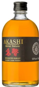
WHISKIES | BLEND AKASHI MEISEI DELUXE 50CL / 50°