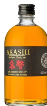
WHISKIES | BLEND AKASHI MEISEI DELUXE 50CL / 50°