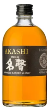
WHISKIES | BLEND AKASHI MEISEI 50CL / 40°